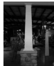
21) Clean surface of column with cleaner recommended by the paint manufacturer. Paint with 2 coats of acrylic latex paint.