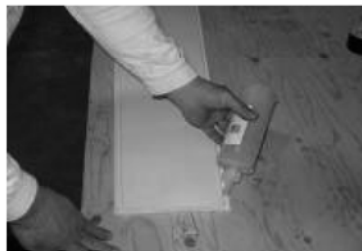
13) Apply adhesive to final panel