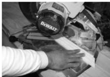
17) Using miter saw, cut base trim pieces to fit around bottom of column