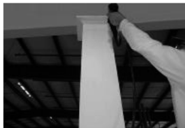
16) Glue ¼ cap piece and slide into place. Pin nail cap moulding to top of column.*