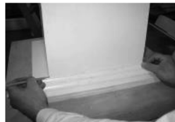
18) Use column shaft to mark cut lines for miters (cut long and work your way shorter for best results)