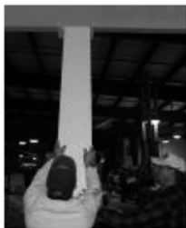
14) Assemble final panel to column using E-Z lock joint