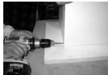
15) Screw or nail final panel to secure