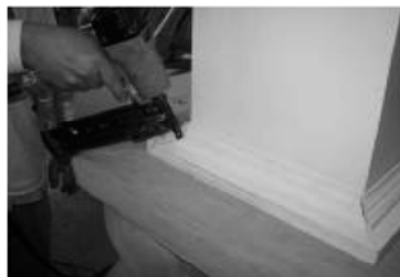
19) Apply adhesive to moulding and pin-nail into place.