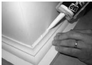
20) Caulk using latex caulking compound to fill an gaps & nail or screw holes.